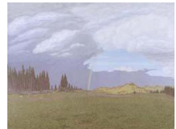
Orage en montagne, arc-en-ciel, 1901