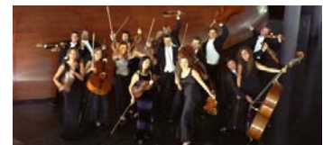
The Lucerne Festival Strings