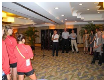
Bundesrat Ueli Maurer hält eine Ansprache vor dem Schwimm-WM-Team