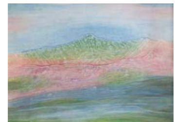
Pic Marcellly, reflets rouges et verts, sans date