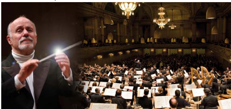
The Tonhalle Orchestra Zürich

As a bright star in the world of symphony orchestra, the ensemble has been shaped by eminent chief conductors, leading it to rank amongst the most prestigious orchestras of the world. In recent years, it has developed into one of Europe's leading ensembles, recording a series of ground-breaking and innovative albums. The 150-year-old orchestra will perform Mahler's Symphony No. 5 to Chinese Mahler fans as a token of respect for the symphony Master on the centenary of his death.