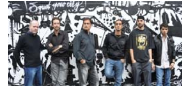
Jazz band bconnected