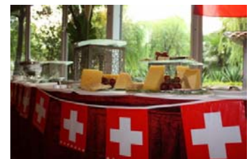
Delicious cheese buffet