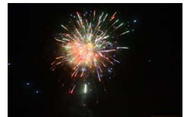
Traditional 1 st of August fireworks