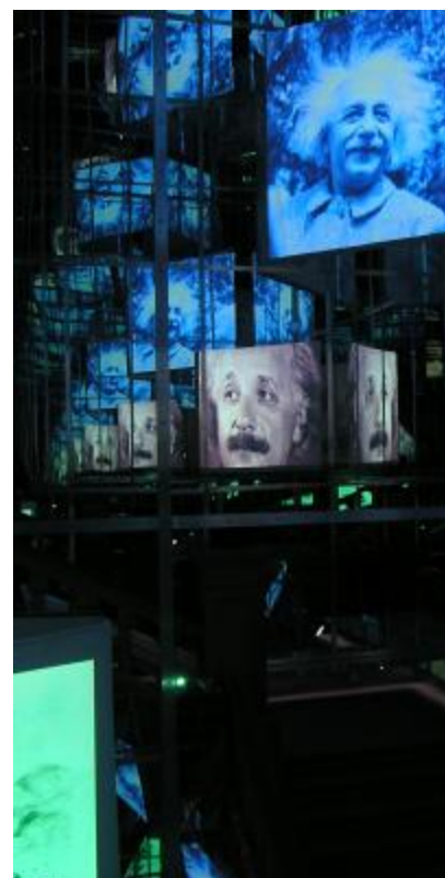
Video-Installation in the museum staircase in 2005. 2005年展览现场图片

E+ Swissnex China Homepage: www.swissnex.ch/locations/shanghai