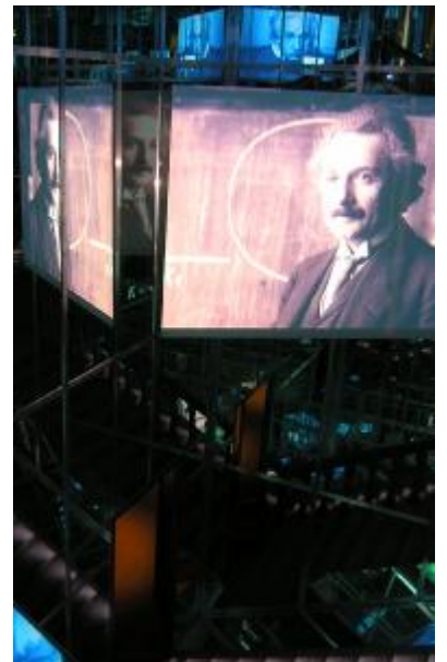
Video installation spectacularly mirrored on the museum staircase. 2005年展览现场图片