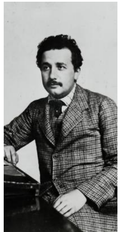
Quite satisfied with his lot as government patent office employee: Albert Einstein at the Patent Office in Bern, 1905.

时值 2010 年瑞中两国建交 60 周年，“阿尔伯特·爱因斯坦 (1879-1955)”展览在中国的巡展由瑞士联邦委员兼外交部长卡尔米·雷伊阁下和中华人民共和国外交部部长杨洁篪作为官方监护人。