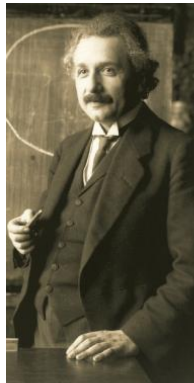
A great social event: Einstein's lecture in Vienna, 1921. 阿尔伯特·爱因斯坦于维也纳的课堂上，1921年

“Albert Einstein (1879–1955)” can be visited at the China Science and Technology Museum (CSTM) in Beijing from 1 st June 2010 to 6 th October 2010. Three further stops are planned; the first being the Guangdong Science Centre (GDSC) in Guangzhou where the exhibition will be shown from November 2010 to February 2011 (tbc), followed by the Hong Kong Museum of Science which will display the exhibition from April through August 2011 (tbc). The finale of the exhibition is due to take place in Shanghai in the winter 2011 – 2012.