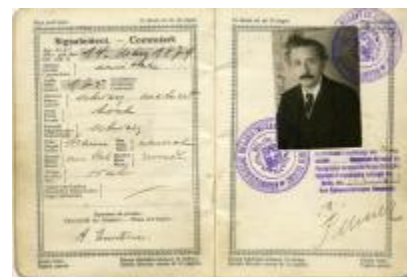
Swiss by conviction – Albert Einstein's Swiss Passport, 1923.

China Science and Technology Museum/中国科学技术馆 Phone/ 电话: +86-10-5904 1188 www.cstm.org.cn