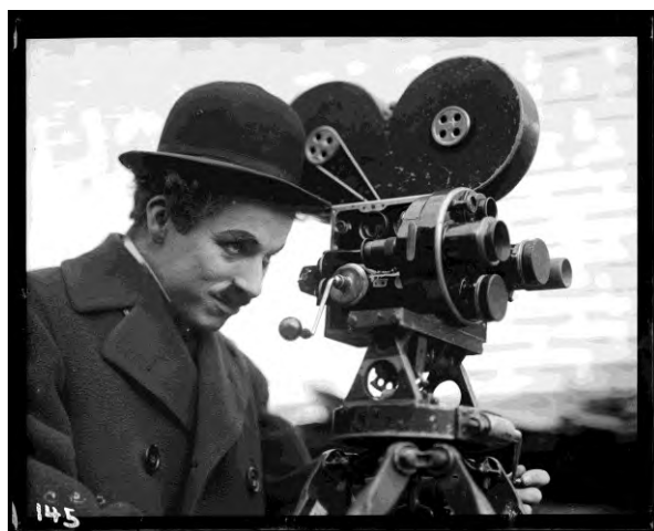
Modern Times (United Artists), 1934-1935

Charlie Chaplin is the founder of modern comedy, one of the most influential performing artists and film directors of the 20th century. His comical image with bowler hat, bamboo cane and small moustache is well known and deeply rooted worldwide. The recipient of a Special Oscar in 1928 for The Circus and an Academy Honorary Award in 1972, Chaplin made an immeasurable contribution to the development of film in the 20th century. He himself was a famous pacifist and social activist.