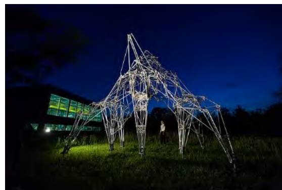
Art work from Rena Giesecke and the team she was working with in 2016/2017 © Demetris Shammias

Rena's work evolves around using material properties for the invention of new processes and expressions ranging from object to architectural installation. Her interest is in combining materiality, new technologies and intuition as tools for creativity – to produce unexpected results that are not solely a consequence of human intellect, but also involve authorship of the other.