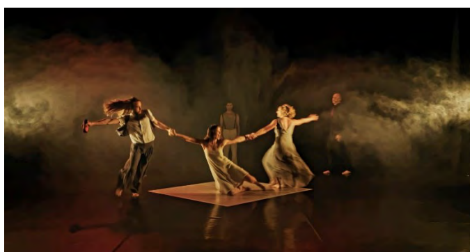
Compagnie Interface: Vive la vie

Since 1990, the Compagnie INTERFACE creates its own shows which it develops by merging different type of arts. Its practice can be understood through its name: INTERFACE. An interface is a language which is able to link two uncommon universes, not only dance, theatre and musique but also culture and economy.