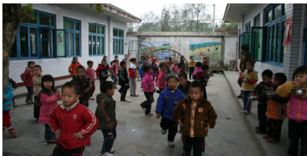
Temporary playground of the school

For a successful enforcement of the project a minimum budget of 7 Million RMB is needed. So far 6'156'112 Million RMB have been collected.