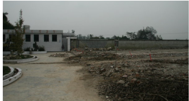
Long Xing Town Central Nursery School, what is left after the earthquake