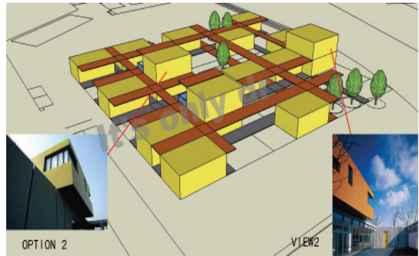
Potential draft by Virtuarch Shanghai of the school in Sichuan with space for 400 pupils.