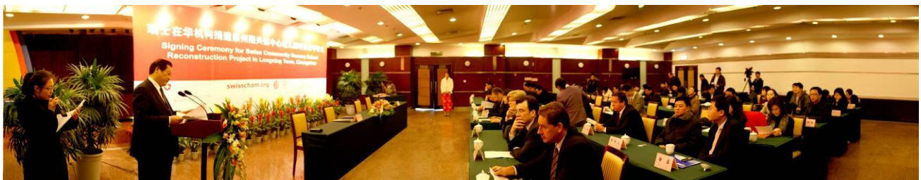
Media representatives carefully listen the speech of the representative of Chongzhou Municipal Government

The conceptual design by a Swiss architecture office is focusing on a learning environment suitable for children of this age, providing numerous inside and outside spaces for playing, combining the qualities of a Swiss town environment with the ones of traditional Chinese palaces, while realizing fully environment-friendly and therefore sustainable school buildings. With an area of 4,200 square meters, the entire school building will be suitable and accessible for disabled children, too. During the construction, some Swiss donor enterprises also provide a series of advanced construction management support and valued services, including training of local builders in sustainable construction and service planning, localized risk management and standardization, provision of practical specialized risk engineering technologies. Enterprises also aim to help the local communities to maintain the infrastructure on their own at the possibly lowest price, so as to ensure successful construction of a quake-proof, sustainable, high quality, and environment-friendly school.