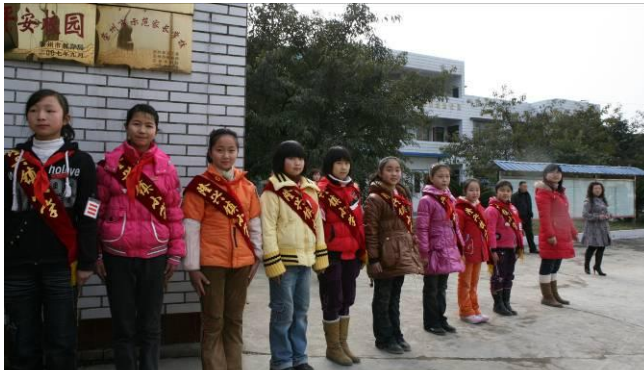
Pupils welcome the delegation from Switzerland at their School in Long Xing Town

On January 12, 2009, the Swiss Community Reconstruction in Sichuan - School & Housing Sponsorship Project and Sichuan Chong Zhou Municipal Government signed a cooperation agreement on the reconstruction of the central kindergarten in Long Xing township of Chong Zhou city in Sichuan. The signing ceremony of this reconstruction project was attended by the Ambassador of Switzerland in China, the Vice President of the SwissCham Shanghai, a Board Member of SwissCham Beijing and the Mayor of Chong Zhou city.