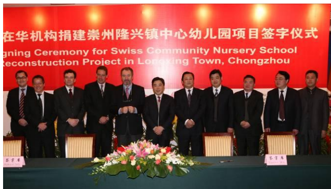
The Swiss and the Local Government Delegation at the Signing Ceremony in January 2009

12.01.09 the agreement with the local government is officially signed. The Ambassador of Switzerland in China, the Vice President of the SwissCham Shanghai, a Board Member of SwissCham Beijing as well as some of the donors attend the ceremony with the Mayor of Chongzhou and other representatives of the city.