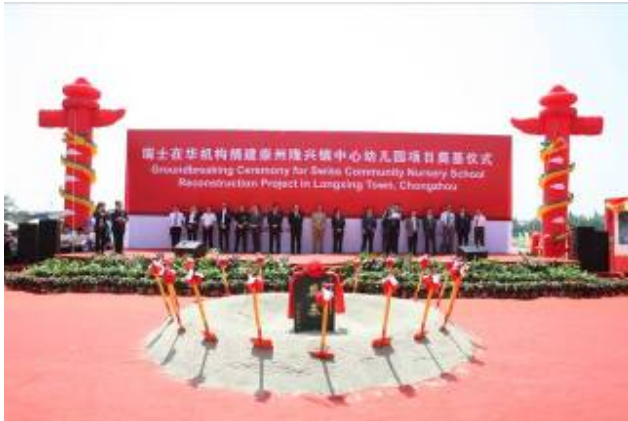
Groundbreaking Ceremony in LongXing Town in May 2009

The groundbreaking ceremony took place on May 20th, 2009 and was attended by the Ambassador of Switzerland in China, the President of SwissCham China, Board Members of SwissCham Beijing and Shanghai, various representatives of the donor companies as well as the Mayor of Chongzhou city and Member of the school. 12 articles were included in both national and local media, with over 40 website reprints.