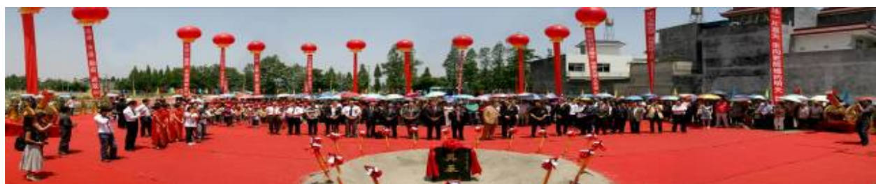
Ground Breaking Ceremony in Longxing town, 20 th May 2009