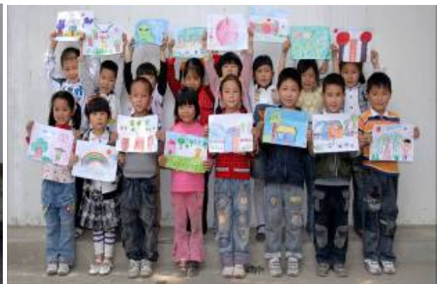
Drawings of the school class in Longxing Town, China

Book now a Calendar 2010 and support the School Reconstruction Project in Sichuan!