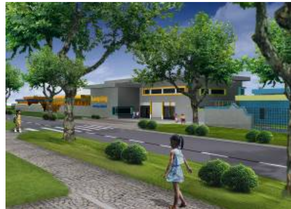
The entrance of Longxing Nursery School

The arrangements of the classroom buildings refer to the pattern of habitation in rural areas and small towns in Sichuan as well as in Switzerland. The Goal of the design concept for the project is to blend into the current environment, while being strong enough to mark its place also during the phase of development Longxing town will make during the years to come. By using fast growing bamboo as plants and as construction material for the corridors, the project implements environmental-friendly techniques and therefore creates sustainable school buildings.