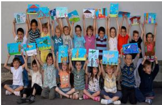
Drawings of the school class in Switzerland

You can book your calendar today by sending an email to: sichuan@sha.swisscham.org