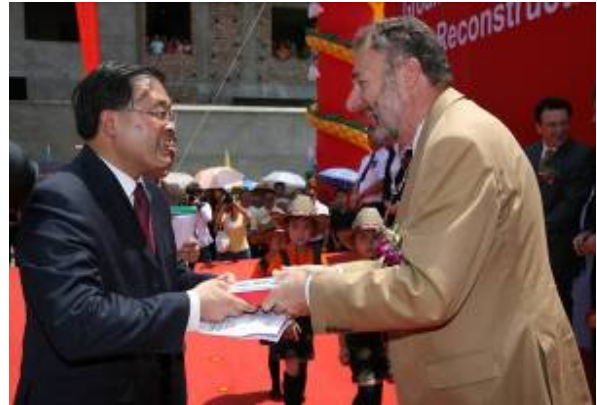
Exchanging presents between the Swiss delegation and the Longxing representatives

The new kindergarten was designed by the Swiss architecture office Virtuararch in Shanghai is inspired by traditional Chinese garden design. The concept design is focusing on learning environment suitable for Children of kindergarten age, providing several inside and outside spaces for playing. The arrangements of the classroom buildings refer to the pattern of habitation in rural areas and small towns in Sichuan as well as in Switzerland.