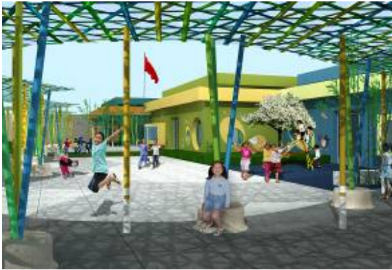
Perspective inside the school

The Concept Design by the Swiss architecture office Virtuarch in Shanghai is focusing on a learning environment suitable for children of kindergarten age, providing several inside and outside spaces for playing. With an area of 6,500 square meters, the school can host over 300 students and will be suitable and accessible for disabled children too.