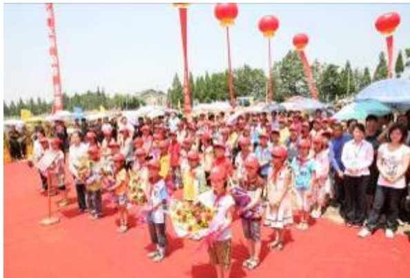
A hearty and warm welcome for the delegation at the ground of the ceremony