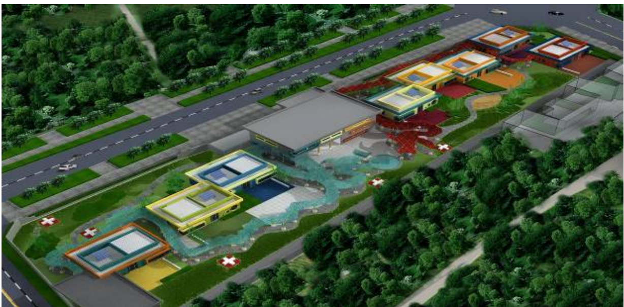
Birdview of dragon shaped Longxing Nursery School

In order to create a feeling of learning and exploring by walking inside the school, Virtuarch has used dragon-shaped covered corridors to link all buildings as well as to separate the long plot into different spaces. The corridors are inspired by traditional Chinese garden design. By following the red or the blue dragon corridor, children will be led to their classroom and will easily recognize it as each classroom building has a different colour and a different animal painted on it.