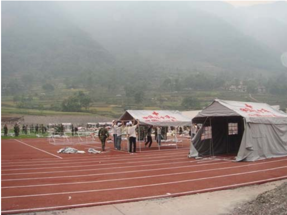
RCSC volunteers setting up tents for survivors (Red Cross Society of China)

The RCSC is working on a detailed plan of action. Through this appeal, funding will be provided for the initial relief phase, in addition to funding mobilized by the RCSC. This appeal will cover the provision of relief supplies for approximately 100,000 beneficiaries most in need and include the following: