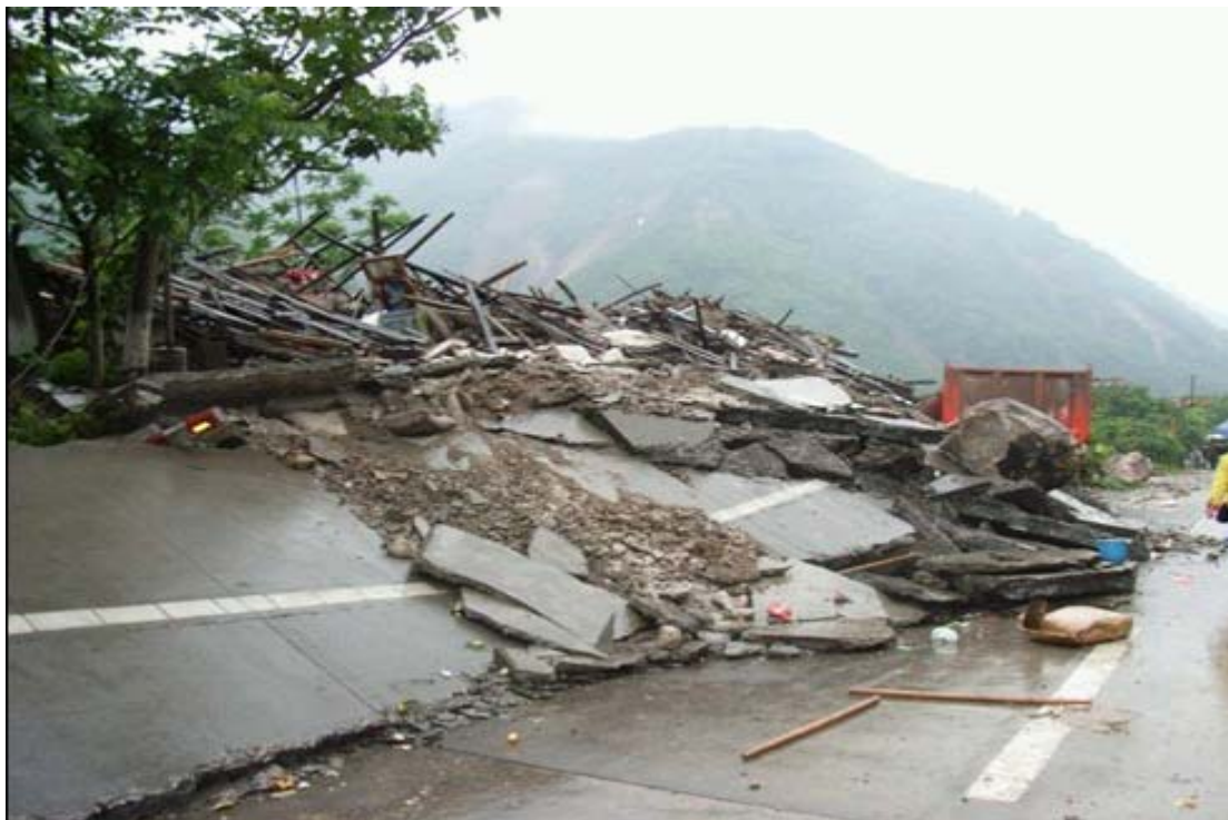
Damaged roads in Wenchuan County have disrupted transportation routes.

There are more than 26,000 injured survivors in Sichuan province, and medical supplies are urgently required. Many hospitals and clinics have collapsed and medical professionals have been treating patients in the streets or in tents with whatever supplies they have available.