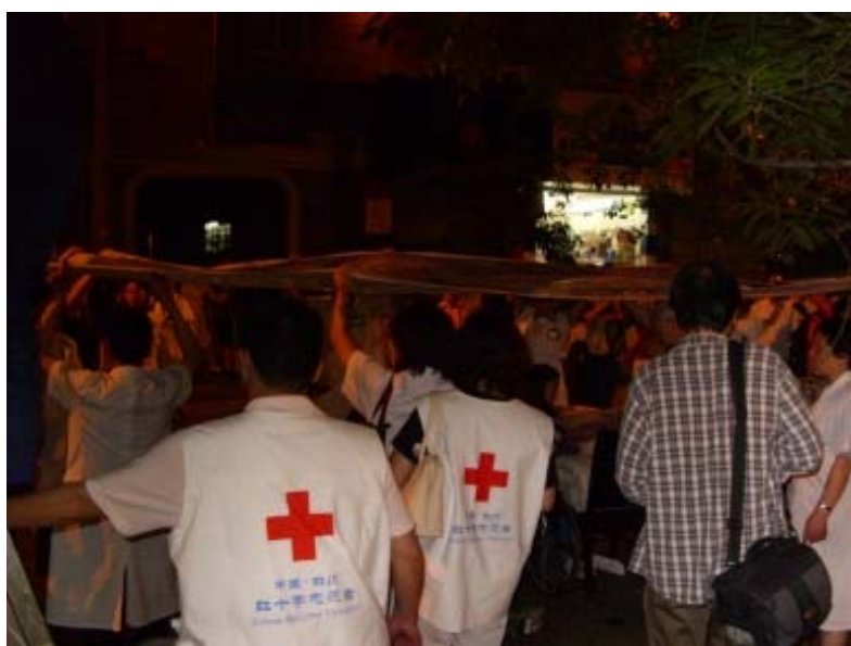
Volunteers lifting plastic sheeting to shelter injured people on a rainy night in Beichuan, 14 May.

So far, a total of eight teams have been mobilized by RCSC headquarters to support rescue and medical work. Besides these teams, many provincial Red Cross branches have also sent their response teams directly to Sichuan. Hunan Provincial Red Cross branch's emergency response team, consisting of 34 people has been working in Shifang since 14 May. This team is divided into two groups which rotate around the clock. The International Federation's media specialist is joining this team today in Shifang.