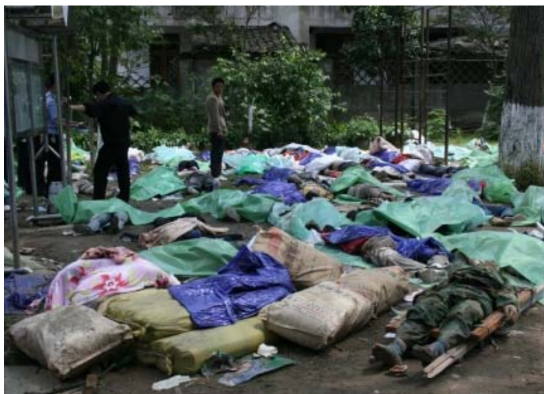
Survivors looking for missing family members among the dead in Beichuan.

The psychological effect of the disaster on those who survived and witnessed the disaster in local communities as a whole is enormous. As the survival chances of those trapped in the rubble erodes by the hour, families are gradually facing the probability of not finding their loved ones alive. Local Red Cross staff and volunteers have been also affected, with many still missing. An urgent need for psychological first aid for disaster survivors is clear and the Red Cross plans to integrate this component throughout the operations. Providing emotional support simply by being there and advising people on how to cope with transitory psychological effects, which are to be expected in the aftermath of such traumatic events, are simple and effective.