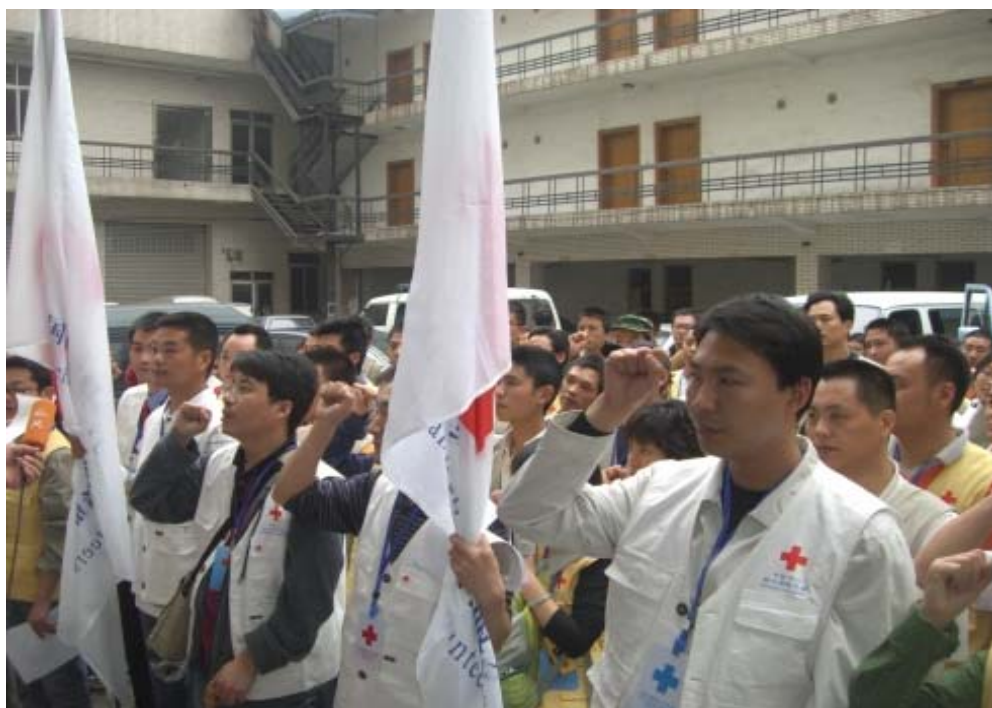
A local Red Cross volunteer team pledging their courage and determination to save those affected by the earthquake prior to their departure on 16 May to the affected areas, Chengdu, Sichuan.

Summary: The 7.8-magnitude earthquake which devastated the south-western province of Sichuan on 12 May has left 28,881 dead, 198,346 injured and 4.8 million people displaced, according to the emergency