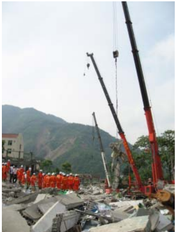
Rescue teams searching for people still buried under the rubble in Beichuan, 16 May (Red Cross Society of China, Sichuan branch).