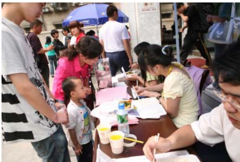
Citizens in Chengdu donating to Red Cross for earthquake relief. May 16.

The International Federation will provide support to the RCSC's relief operations, especially in areas of international coordination, monitoring the evolving relief situation and conducting health, water and sanitation, and logistics assessments. After discussion with the Sichuan Red Cross branch, it has been agreed that the International Federation will target its support to the RCSC relief operations in Mianyang prefecture, one of the two most affected areas.