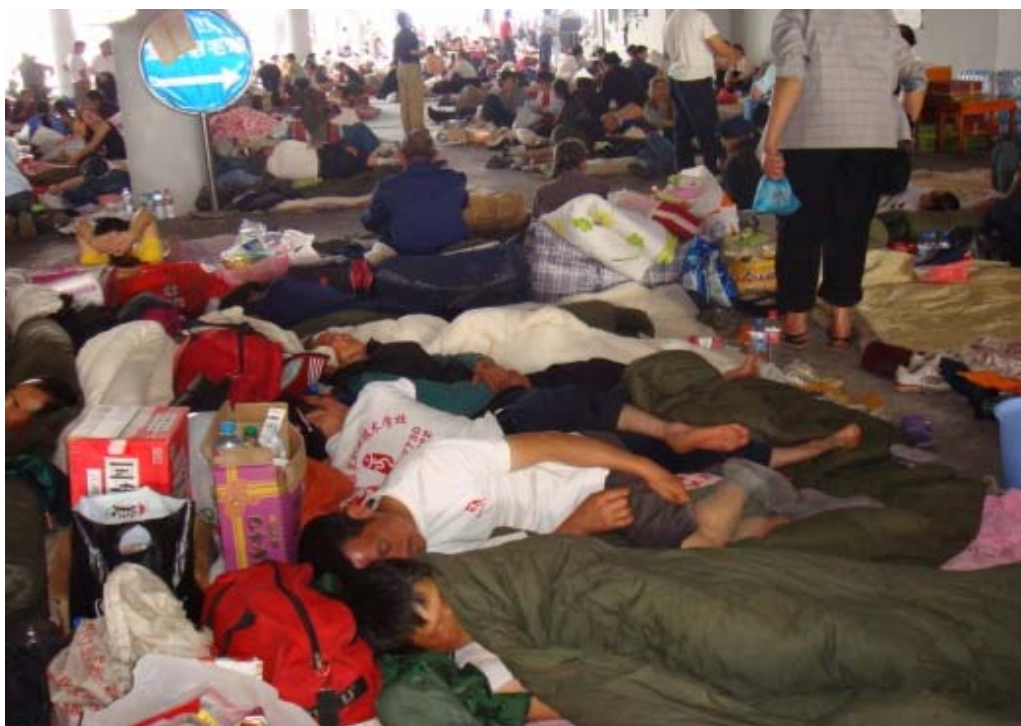
Jiuzhou sport centre is providing shelter for over 20,000 people who have lost their homes, Mianyang, 18 May (International Federation).

Located in the north-west of Sichuan province, the Mianyang municipality is a traffic link, 90 kilometres from Chengdu, the capital of Sichuan province. The total area of Mianyang municipality is 20,249 kilometres 2 with a population of 5,170,141 people. The distance between Wenchuan (the epicentre) and Mianyang seat is approximately 170 kilometres. Beichuan, Pingwu, Anxian and Jiangyou are the four most damaged counties in Mianyang, with Beichuan at 60 kilometres from Wenchuan. By 18 May, the confirmed death toll in Beichuan and Pingwu was 8,410 and 1,200 respectively. A total of 12,149 confirmed deaths and 68,100 injured have been reported in Mianyang.