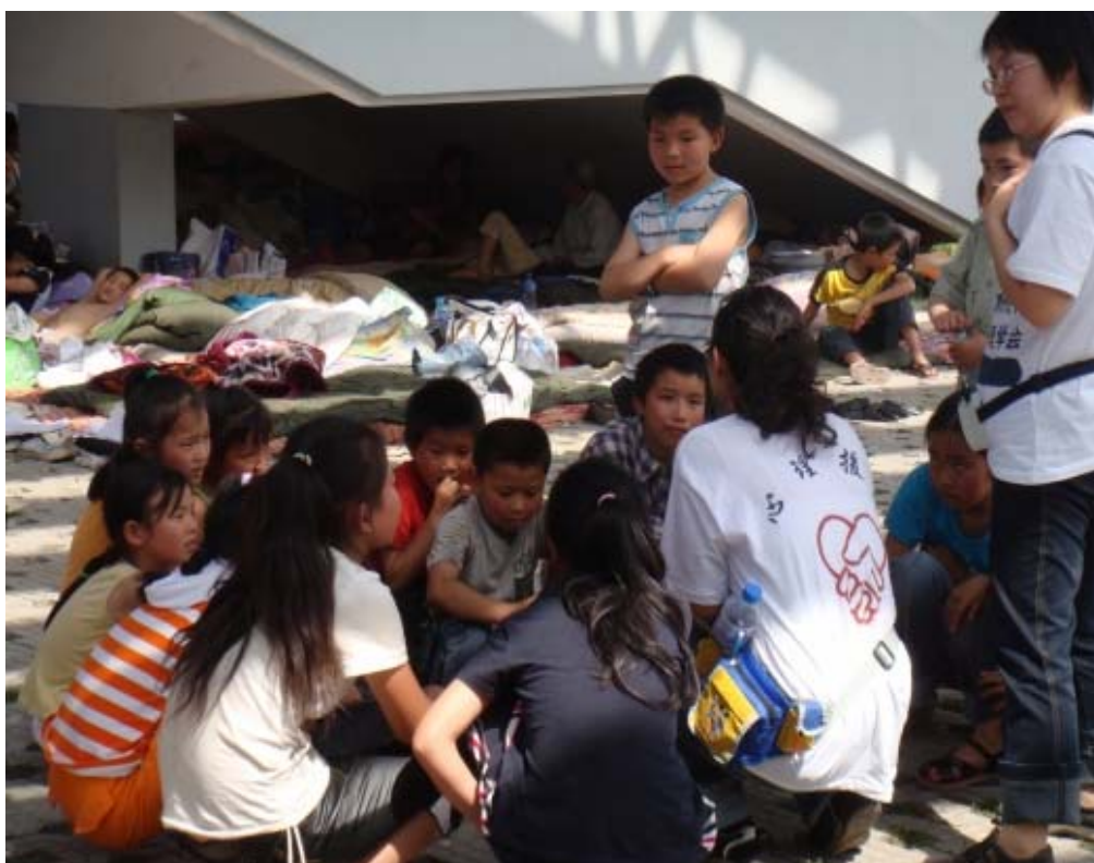
Volunteers playing with children in a temporary camp. Many people have lost members of their family, making the provision of comfort and other psychosocial support vital in alleviating the trauma of personal loss. Mianyang, 18 May.

Other bilateral support from within the Red Cross Red Crescent Movement directly to RCSC includes contributions from Cambodian Red Cross, Republic of Korea Red Cross, Norwegian Red Cross, Pakistan Red Crescent, Spanish Red Cross, Swiss Red Cross, Thai Red Cross and Turkish Red Crescent.