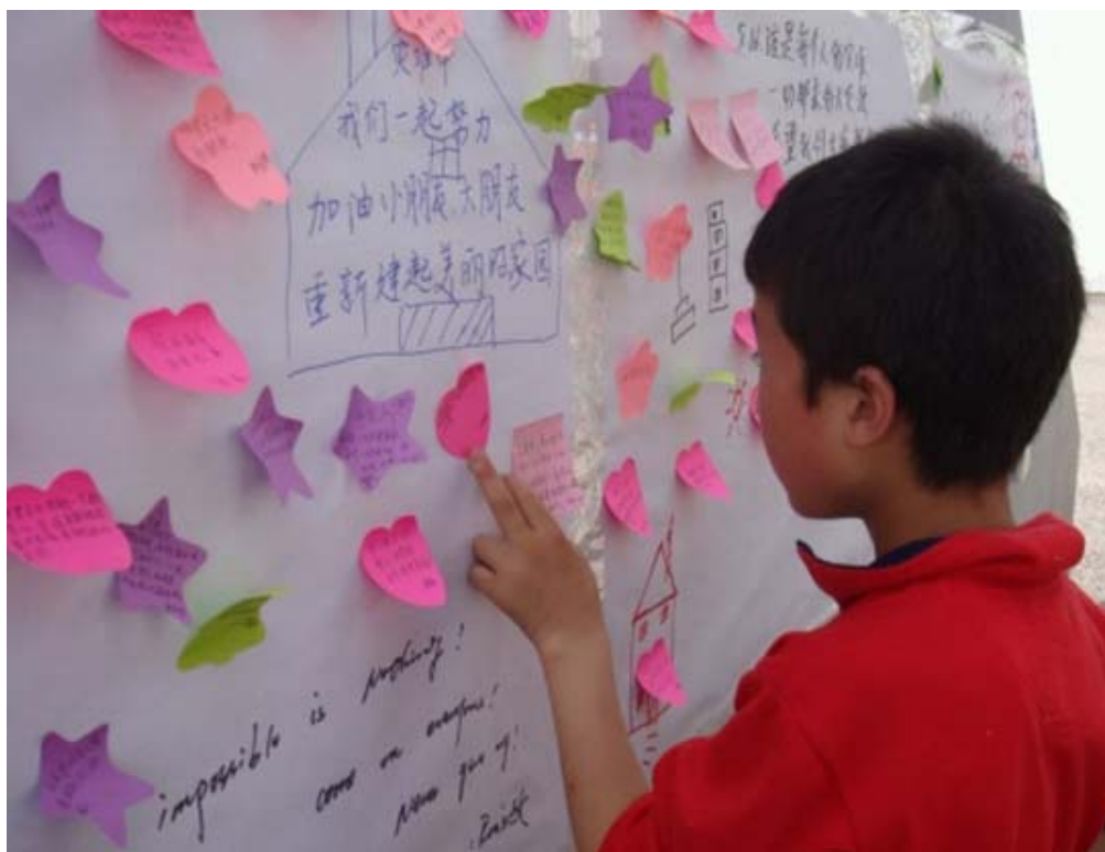
Children have been writing their thoughts on a wall at the Juizhou sports centre. These stories are helping children to cope with their grief, Mianyang.

The International Federation's regional office in Beijing has been strengthened, with the International Federation representative in Mongolia and a member of the Asia Pacific Zone planning monitoring evaluation and reporting unit both joining the team in Beijing. A logistics delegate from the International Federation's Pakistan country office is also being deployed to China.