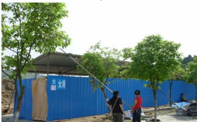
A temporary latrine set up in an emergency camp near Juizhou, Mianyang, 18 May.

Those working in the affected areas face a huge task in providing safe water and sanitation for the large number of displaced people. Those displaced have access to donated bottled water, but based on limited field observations, there seems to be limited access to water and sanitation facilities. In a camp of over 30,000 people in Mianyang prefecture, only 150 toilets are available, resulting in long queues of up to 20 minutes. No shower facilities were available. Under these conditions, the threat of an