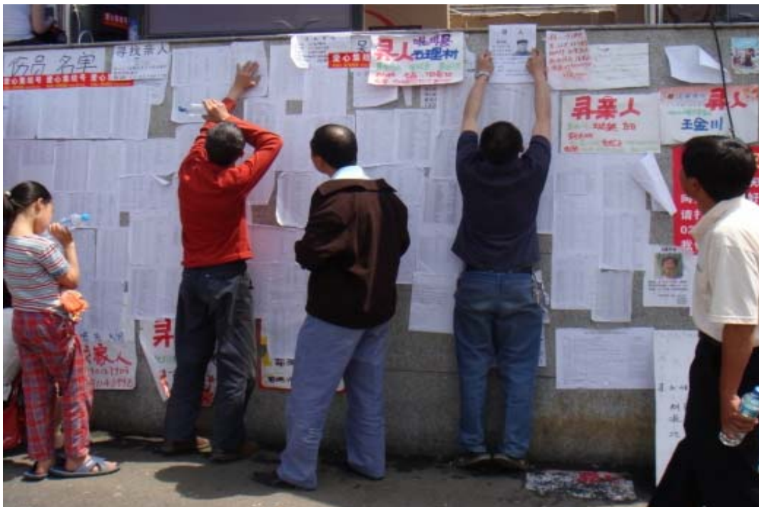
Survivors post information on missing family members on the shelter camp's information wall, Mianyang, 18 May (International Federation).