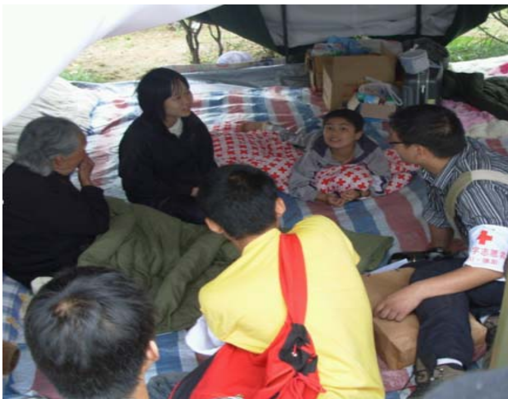
Red Cross psychosocial support teams have been providing comfort to affected families through counselling. Anxian, 22 May 22, International Federation/Liu Lei.

As of 23 May, the death toll from the powerful earthquake which struck the southwest of China on 12 May so far has risen to 55,740, with 292,481 injured, 24,960 missing and 11.36 million displaced according to the information office of the State Council. <click here for a detailed table> . The highest number of casualties occurred in Sichuan province with a recorded 55,239 deaths, and 281,066 injured. The massive earthquake on 12 May levelled entire villages and according to the ministry of civil affairs, some five million people are now homeless. In Sichuan, 1.5 million houses were totally destroyed. Some 4,000 children have now been made orphans as a result of the earthquake according to Sichuan provincial civil affairs department. Aftershocks continue still, with 7,586 recorded thus far.