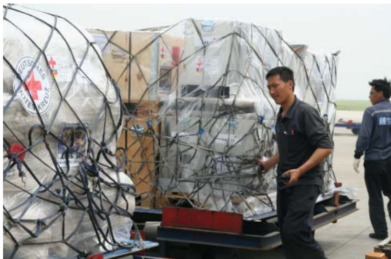
The field hospital arriving in Chengdu airport.

The 's country office in Beijing will be further strengthened by three to four additional staff over the next couple of days, to address functions such as coordination, logistics, shelter, and recovery in support of the RCSC operation. Currently in Beijing to provide further support to the regional office are the American Red Cross delegate based in New Delhi, a planning monitoring, evaluation and reporting staff from the Asia Pacific zone, the logistics delegate from Pakistan and a Netherlands Red Cross bilateral in-country staff. The regional office's team is presently in the field.