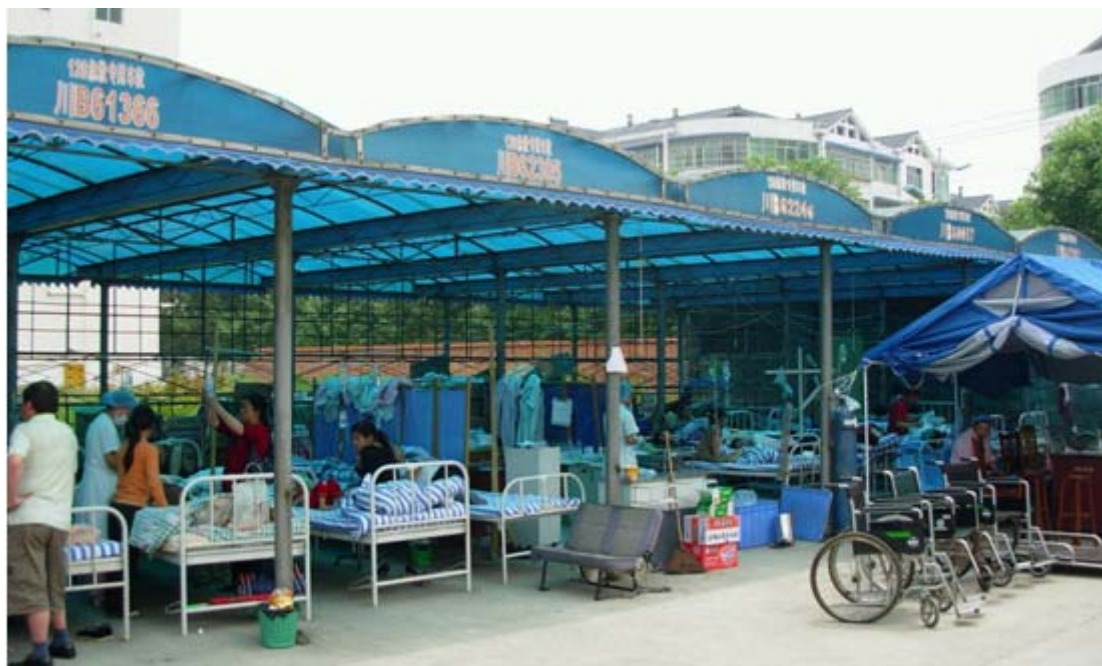
Hospitals considered unsafe have meant tents such as these are now converted into temporary wards for patients. Anxian, 22 May, International Federation/ Liu Lei.

According to the ministry of health, 68,608 people have been hospitalized due to the quake. By 22 May 3,444 had died in hospitals, 28,497 had been discharged and 33,665 were still being treated. Of these, 3,002 patients have been transferred outside of Sichuan for further treatment.