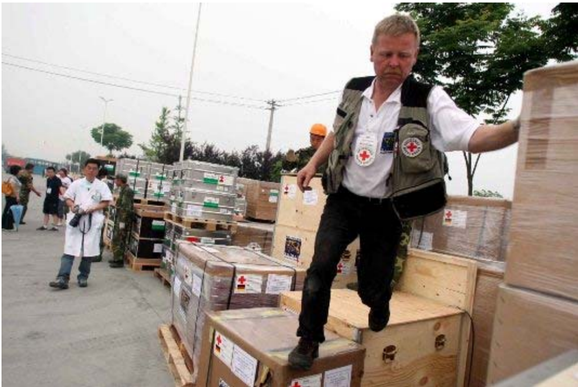
The German Red Cross team setting up the field hospital in Dujiangyan, Sichuan.

The German Red Cross field hospital arrived on 23 May and was set up in Dujiangyan, Sichuan. It is now fully operational.