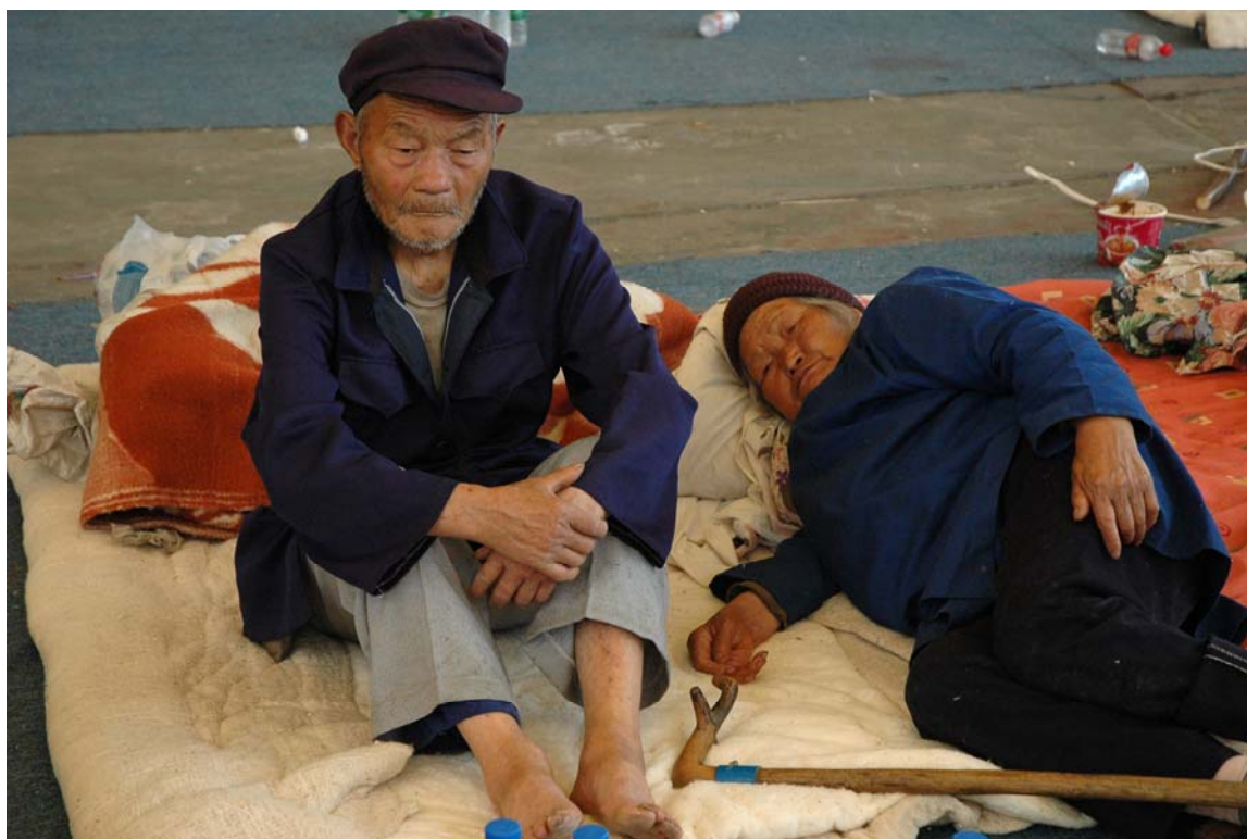
An elderly couple among the thousands in temporary shelters in Dujiangyan

The government stated that it will provide each person affected by the disaster with CNY10 (CHF 1.5) and half-a-kilogramme of food per day for three months. The sheer numbers involved to sustain this is overwhelming. For example, the Deyang prefecture alone (with 800,000 people affected) will need 400,000 kilogrammes and CNY 8 million (CHF 1.2 million) per day. It is also providing each family with compensation of CNY 5,000 (CHF 753) for each person who has died as a result of the earthquake. Orphans, the elderly and the mentally and physically disabled who had lost their families will receive CNY 600 (CHF 90) per month for three months.