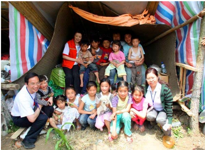
Children in Anxian huddle together with members of the Red Cross assessment team

cooking units, medical equipment, tents, water purification equipment and generators worth CNY 15 million (CHF 2.3 million) were also sent to Sichuan. Relief items from RCSC headquarters were also sent to Chengdu, which includes ten ambulances, 1,600 heavy duty gloves, 2,400 masks, winter clothes, tents, food and medicines.