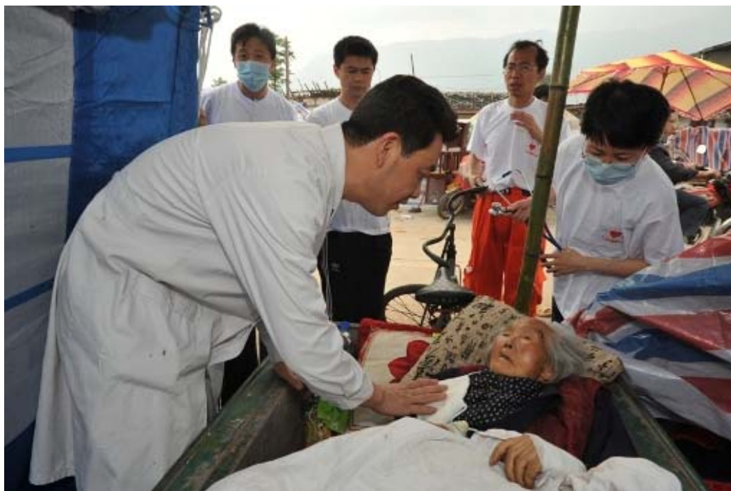
A Red Cross medical team attending to a 102-year old woman pulled from the rubble.