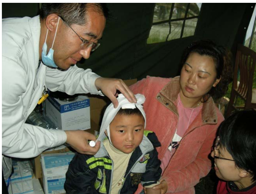
A Red Cross doctor treats a boy injured by falling earthquake debris

Disease control staff continue to spray disinfectant in the affected areas. Some 9,543 personnel are involved in environmental disinfection and epidemic control. Thus far, all villages in Chengdu, Guangyuan and Mianyang have been disinfected while 75 per cent of the villages in Deyang and 55 per cent of those in Wenchuan, Maoxian and Liixan have also undergone the same treatment. Altogether, 55,252 dead have been buried.