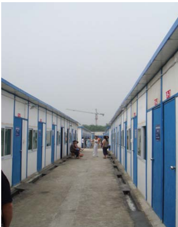
A government relocation camp hosting 1,500 people. Each unit houses three people. The camp has a medical point, temporary school, latrines and shower facilities. Dujiangyang, Sichuan. (27 May. International Federation)

The ministry of civil affairs has signed contracts with 75 tent suppliers as of 26 May for 900,000 tents. It is estimated that from 30 May, 30,000 tents will be delivered daily to Sichuan by road and railway. The ministry of civil affairs estimate that around 3.3 million tents and temporary shelters are needed. The exact number of damaged and collapsed houses will need to be further assessed.