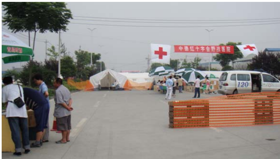
People registering for treatment at the German Red Cross field hospital in Dujiangyan. (27 May. International Federation.)

date, a total of eight additional staff have arrived, four of whom are now in Chengdu. A delegate from Netherlands Red Cross has also arrived to support the European Commission (ECHO) funded tent provision.