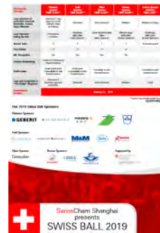
Swiss Ball 2019

Dance, Entertainment & Fun until sunrise