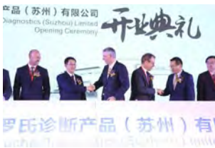
Roche Diagnostics Opening