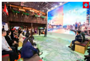
Swiss Pavilion at CIIE

On behalf of the Swiss Confederation, the Swiss Business Hub China (SBH) and Switzerland Global Enterprise (S-GE) managed the Swiss National Pavilion at the first edition of China International Import Expo (CIIE) from 5-10 November 2018 in Shanghai.