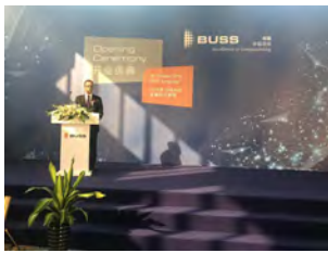
Buss Opening

Swiss investment keeps a positive momentum with intensive openings and anniversaries in the second half of the year.