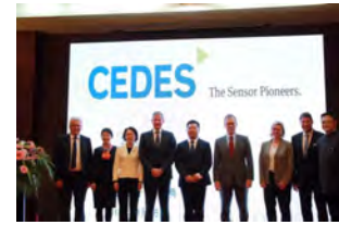
CEDES Opening