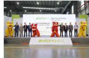
Autoneum Opening