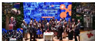
swissnex China 10th Anniversary 'Homes of Drones' event

As the new year steadily approaches and we wrap up our 10th anniversary celebrations, let us take a moment to look back on the past couple of months filled with exciting events and fruitful exchanges.