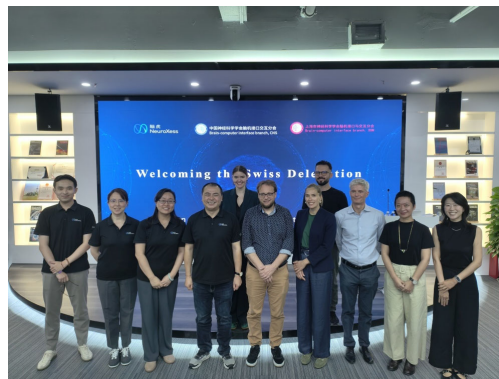
Tech&Ethics II delegation at NeuroXess

Shanghai and Beijing for a week of interdisciplinary dialogue. This year's focus lied at the intersection of ethics and life sciences, exploring how cutting-edge advancements in biotechnology, genetics, and health innovations impact societal values and governance frameworks.