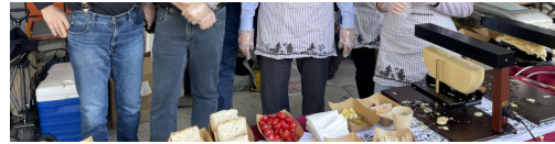
Raclette stand at Deutsche Schule Shanghai

anniversary of its founding. Special praise was given to the Swiss Education Association (SEAS), highlighting their strong and joyful partnership.