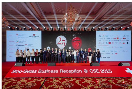
Sino-Swiss Business Reception at CIIE

Another highlight was the annual Sino-Swiss Business Reception, co-organized by the Consulate General of Switzerland in Shanghai and Swiss Centers. This year's event welcomed 350 distinguished guests.