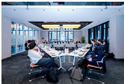
Pop-Up Meeting with Belimo at Belimo

For global executives visiting China, SwissCham China's Pop-Up Meetings deliver rapid, peer-led context. Activated on request and organized within four weeks, each session gathers 5-6 fellow member companies for an intimate, off-the-record roundtable. Past editions – hosted by members like Swiss Re, Belimo, Hilti, Zürcher Kantonalbank, Nespresso, Daetwyler, and Laurastar during visits from their global leadership