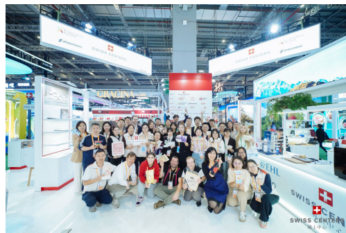
Swiss Cluster Booth at the 8th China International Import Expo (CIIE)

The 290 m 2 Swiss Centers booth at the 8th China International Import Expo (CIIE), featured 26 Swiss exhibitors and 36 brands, 13 of which were first timers. This set new records in terms of both participation and impact. The booth attracted numerous visitors and extensive media attention, interested in renowned Swiss names such as Frey, Swiss Meat, Swiss Wine Promotion, SIGG, and puralpina, but also new brands such as Bee People, Pharmalp, and AVEA. For the second time, Swiss Centers also organised a cluster booth in the “Innovation and Incubation” section, showcasing innovative products and technologies from six Swiss medtech companies.