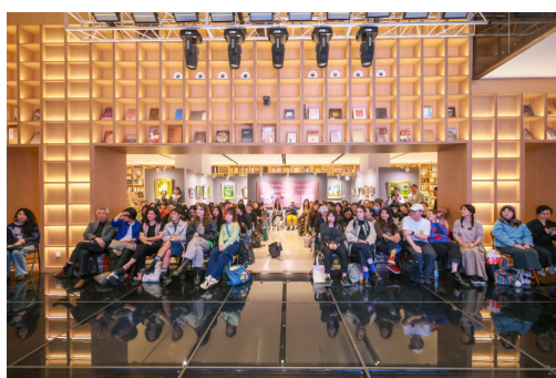
China Shanghai International Children's Book Fair at Shanghai Book City

Launched by Pro Helvetia in 2024 and spanning three editions, the programme "International Masterclass for Children's Book Illustrators" aims to foster professional dialogue and establish a network for children's book illustrators from the regions covered by Pro Helvetia's liaison offices (the Arab region, East Asia, South Asia, and Vietnam) and Switzerland.