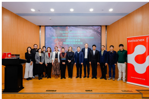
Research delegation at East China Normal University

From 17 to 21 November, Swissnex in China successfully launched a new program, Next Generation Solutions for Disaster Risk Reduction (nexGenDRR), in collaboration with the Swiss Agency for Development and Cooperation (SDC). This program aims to foster dialogue between Swiss and Chinese experts to address viable solutions to mitigate natural hazards