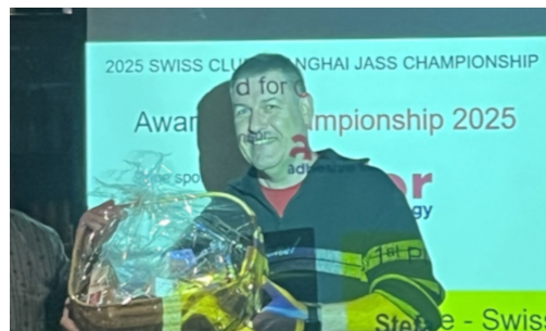
Winner of the Jass Championship 2025