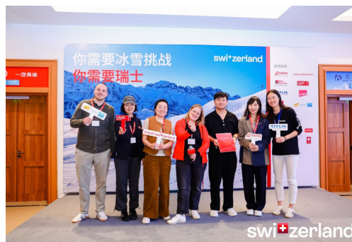
Winter promotion event in Beijing