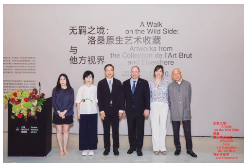
Opening of the exhibition, A Walk on the Wild Side at Power Station of Art

The Power Station of Art in Shanghai, in collaboration with the Collection de l'Art Brut in Lausanne, was showcasing the exhibition, "A Walk on the Wild Side: Artworks from the Collection de l'Art Brut and Elsewhere", from 12 July to 12 October.