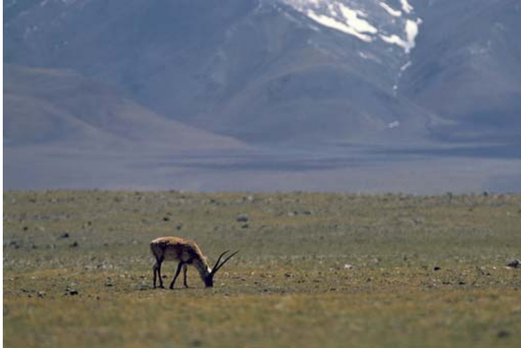
Male Tibetan antelope (Pantholops hodgsonii).

The operations reflect a worrying trend, because between two and five antelopes have to be killed to make just one pure shawl. Since it is impossible to domesticate the animals and shear them, the population of this species is in drastic decline. Luxury lovers are willing to pay several thousand francs for these shawls because Tibetan antelope wool is regarded as the finest, softest and warmest in the world.