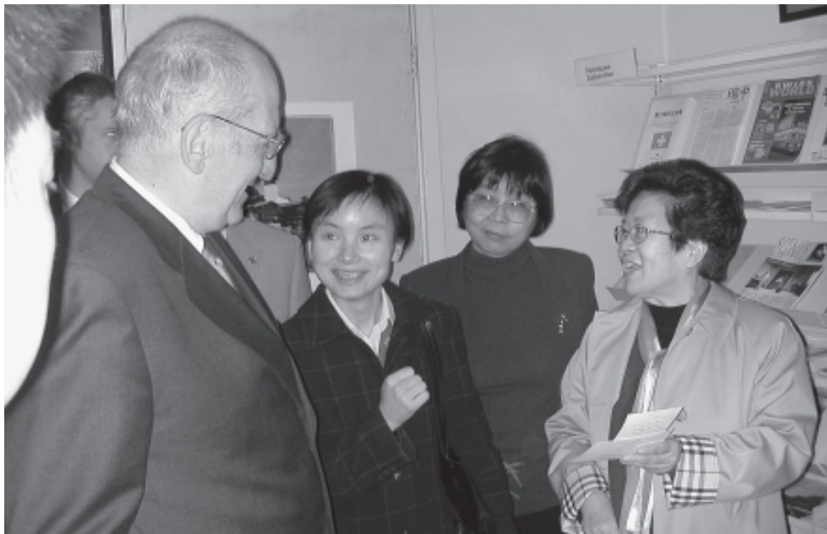
President Couchepin visiting the Swiss Study Center at Beijing Foreign Studies University.

been accomplished with encouraging professors and students. President COUCHEPIN promised that a computer would be given to the centre in the near future. Moreover, the question could be raised as how to give more support and more prominence to this center. Should it be placed higher on the list of projects aiming to promote Swiss presence in China?