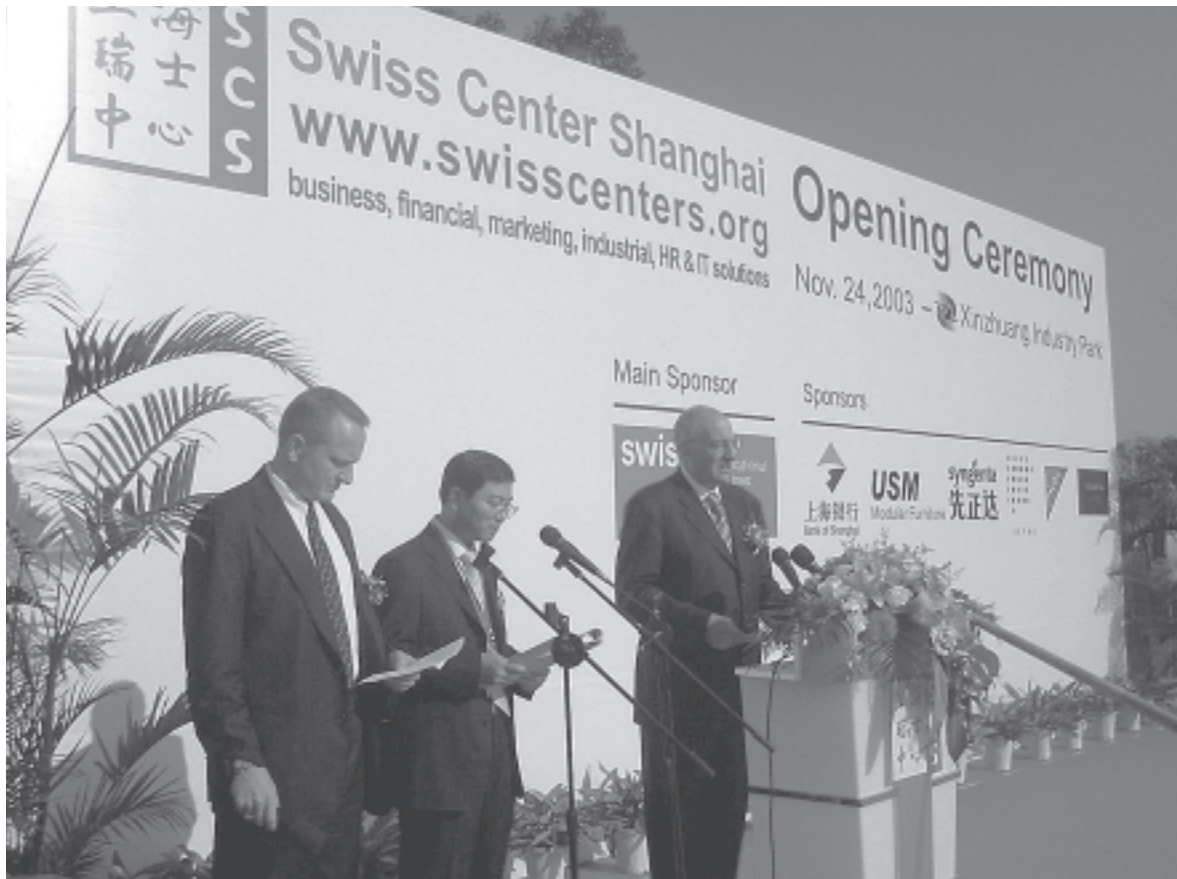
Swiss President Pascal Couchepin (right side) is officially opening the Swiss Center Shanghai.

ing pad" for China and will bring a key contribution to the support of SMEs in China."