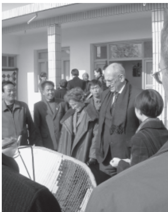
President Couchepin at a peasant's house of Tudun (Province of Gansu).

Should you have any questions, please contact: