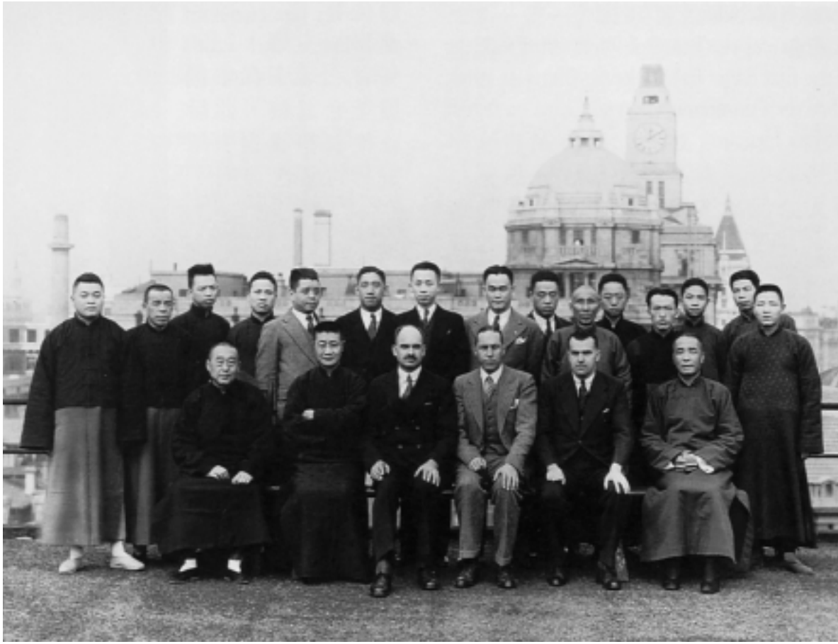
The Siber Hegner Shanghai office team with guests from Switzerland. Photograph taken in December 1934.

So wuchs seit dem späten 19. Jahrhundert die Schweizer Kolonie in Shanghai heran. In den 1870er Jahren lebten maximal zehn Schweizer in Shanghai, um die Jahrhundertwende waren es 35, danach stieg deren Anzahl kontinuierlich auf über 200 bis 1936 an. Schweizer Firmen- und Handelsvertreter liessen sich auch in anderen Städten wie Tientsin, Hankow, Harbin und Kanton nieder.