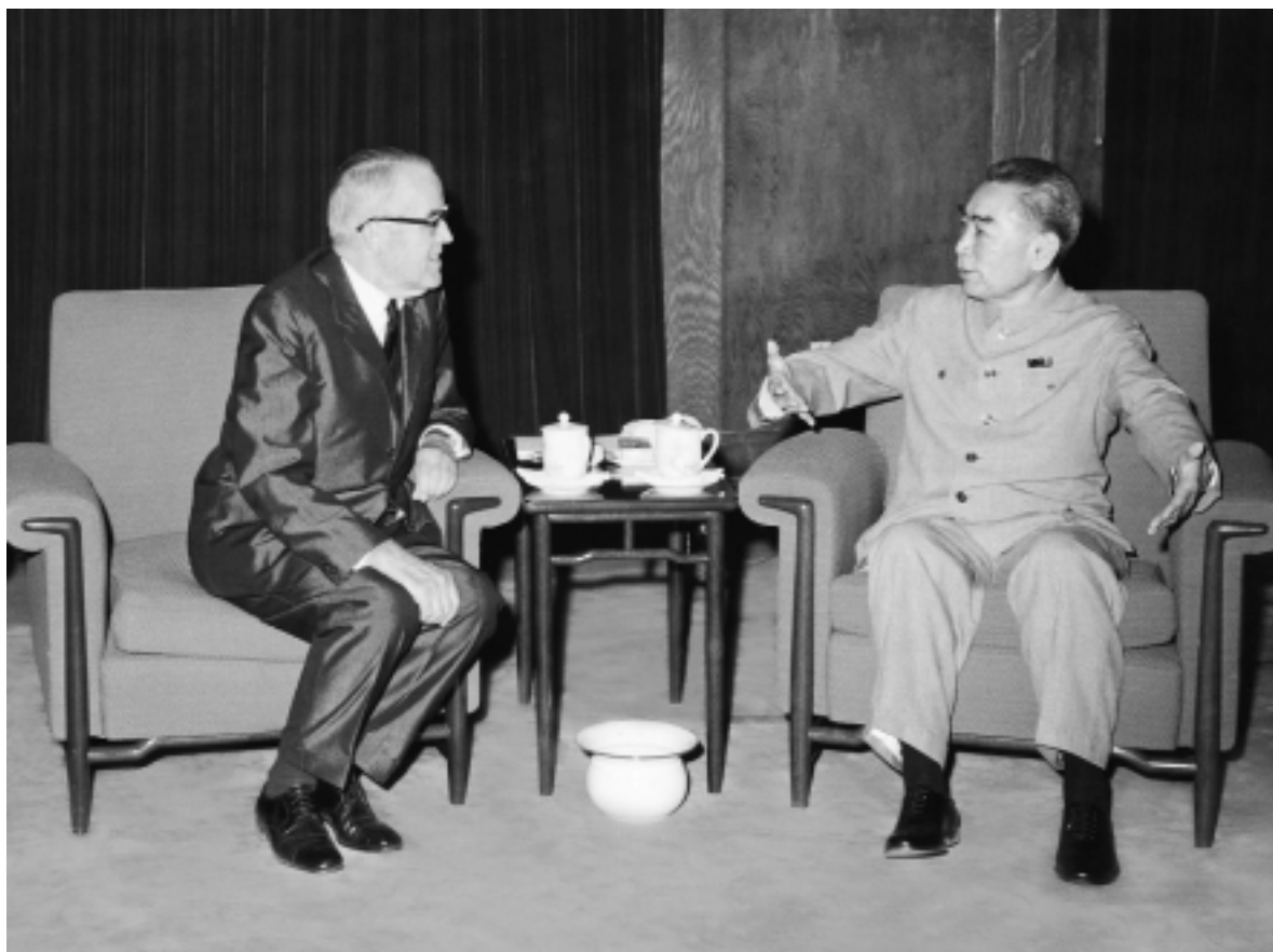
Meeting in Beijing, on the 9th of May 1973 between Prime Minister Zhou Enlai and Max Petitpierre, former President of the Confederation and Minister for Foreign Affairs of Switzerland.

On the 14th of September in 1950 Prime Minister Zhou Enlai and at that time President of the Confederation, Max Petitpierre, decided the establishment of diplomatic relations between the People's Republic of China and Switzerland.