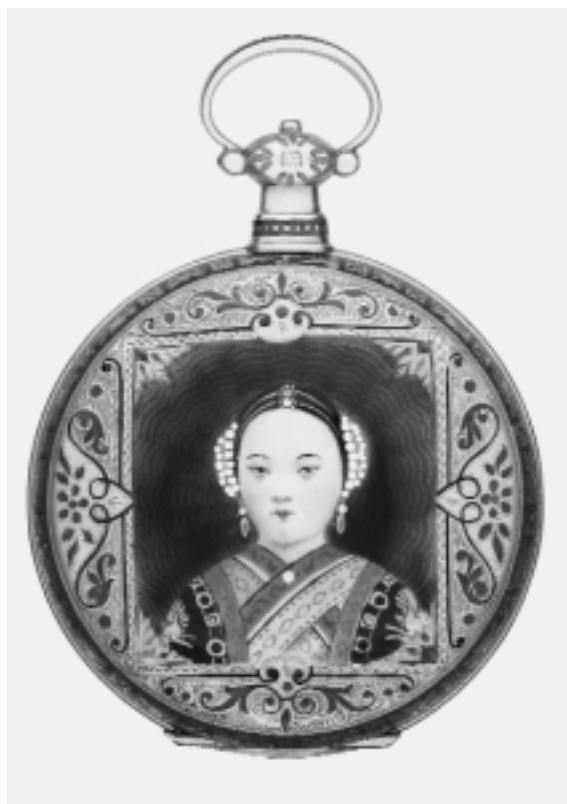
Portrait of a Chinese lady: Enamel-painted pocket watch made by Bovet for the Chinese market, about 1860.

Der erste erfolgreiche Versuch zur Etablierung anhaltender Handelsbeziehungen zu China wurde von den Gebrüdern Bovet aus Fleurier (Val-de-Travers) unternommen, die, von wirtschaftlicher Not bedrängt, nach England auswanderten. Einer der drei Brüder wurde als Uhrenmacher in der Niederlassung einer englischen Handelsfirma in Kanton angestellt. Dieser ermutigte bald seine beiden in London zurückgebliebenen Brüder, eine englische Handelsfirma zu gründen, Uhren nach seinen, dem chinesischen Geschmack entsprechenden, Zeichnungen in Fleurier herstellen zu lassen und diese unter dem Schutz der englischen Ostindien-Kompanie nach China zu exportieren. Damit wurde die "montre chinoise" geschaffen, die der Uhrenfabrikation im Val-de-Travers zu einer neuen und andauernden Blüte verhalf. Das Haus Bovet Frères Fleurier - London - Kanton entwickelte sich zu einer der bekanntesten Uhrenexportfirmen jener Zeit. Nach der Abschaffung des Monopols der englischen Ostindien-Kompanie 1832 wurde das Londoner Haus aufgelöst. Künftig wurden die Geschäfte