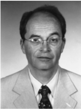
The Ambassador of Switzerland

Twenty years have passed since the birth of the Swiss-Chinese Chamber of Commerce. Twenty years mark the end of adolescence. Yet, the Chamber has long ago reached full mature adulthood. With efficiency and devotion, the Chamber has fully played its important role in the development and promotion of economic ties with China. It has also become in a way parent of two children, fostering as it did the Beijing branch and the Shanghai Business Forum.