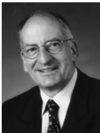
The Federal Councillor of the Swiss Confederation

It is with great pleasure and satisfaction that I extend to you on behalf of the Swiss Government our sincere congratulations on the occasion of the celebration of the 20th anniversary of the Swiss-Chinese Chamber of Commerce.