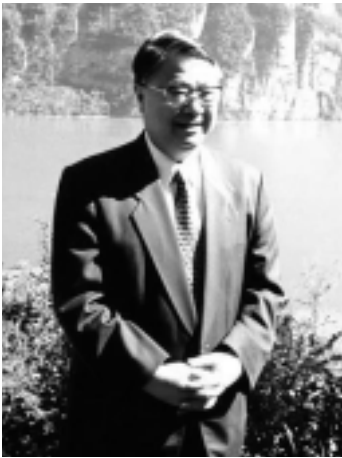
The President of the Chinese People's Association for Friendship with Foreign Countries

This year marks the 50th Anniversary of Swiss-Chinese diplomatic relations. Switzerland was one of the first western country to initiate diplomatic relations with China. Our previous Prime Minister, Zhou Enlai, visited Switzerland as early as the 50's and 60's and was cordially received wherever he went. In 1950 the Swiss government acknowledged the Chinese government under President Mao Zedong as the sole legitimate government of China and on September 14th, 1950 the two countries began their diplomatic relations. Since the reforms and loosening of China's restrictions there has been a marked increase in communication between the two countries and in many areas the exchange of information and cooperation have increased. In 1996 President of the Swiss Confederation, Jean Pascal Delamuraz, undertook a state visit to China and in 1999 President Jiang Zemin made a state visit to Switzerland. He was the first Chinese Head of State to visit Switzerland.