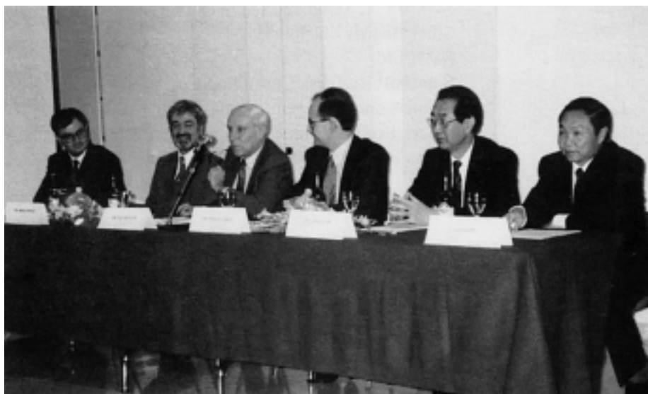
Inauguration of the Lugano Chapter in 1995: