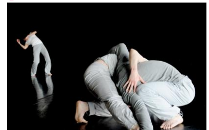
On-stage performance ‘Change’

From September 7 th to 11 th , the Swiss dance troupe DA MOTUS! performed in the framework of the Beijing Fringe Festival, on stage as well as in an outdoor performance, a rare event in the Chinese capital. DA MOTUS! leitmotiv: We are in constant metamorphose, nothing in life is eternal. Time changes, our relationships and values alter. As companions of waning time, changes are a steady guide on our movements through life. Do changes also mean chance, luck? Is renewal not a symbol for life forces and development? The allegorical scenes created by the dancers from Fribourg could not have found a better cradle than Beijing and its ultra rapid development to express constant change. This project was supported by Pro Helvetia.