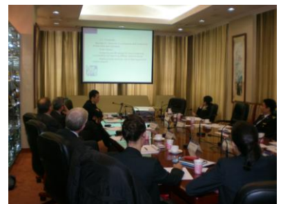
Meeting of the Swiss Customs Delegation at the Chinese Customs Administration to discuss HS (Harmonized System) and AEO (Authorized Economic Operator).