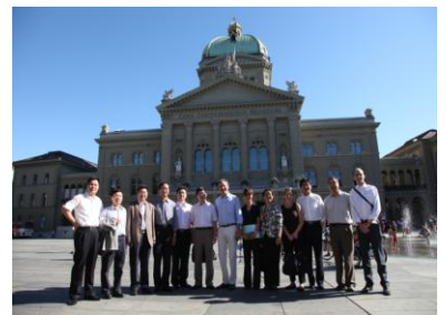
Climate change study tour: the Chinese and Swiss Delegation in front of the Federal Parliament Building