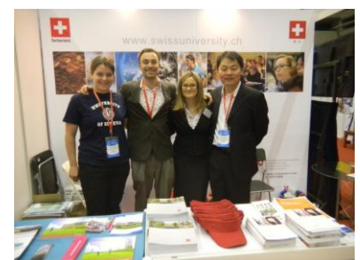
Swiss Universities booth in Beijing

On the weekend of October 16 th -17 th the Embassy participated in the biggest education fair held in China the China International Education Expo 2011 (CIEE). In the " Swiss Universities " booth in Beijing representatives from the University of Geneva, École hôtelière de Lausanne, iheap Lausanne and the