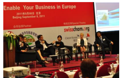
Panellists discussing questions of the audience