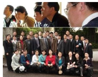
The participants of the Sino-Swiss Management Training Forum during a presentation and below in a group picture.