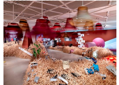
GOOD GUYS: dragon-like chopstick shelf

The opening of the exhibition on migration " La Suisse plurielle " took place on October 19 th at Karamay Culture Center. The essay and drawing contest on the topic of "Diversified culture, harmonious living" for the local primary school students was launched two weeks before the exhibition. 400 essays and 350 drawings were collected. Ambassador Godet and a Vice Mayor of Karamay opened the exhibition in front of local residents.