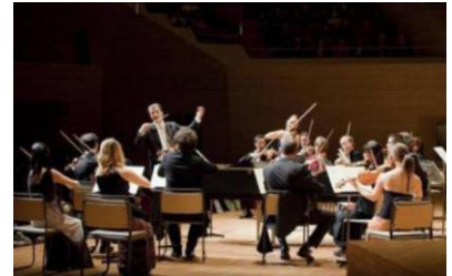
Festival Strings Lucerne