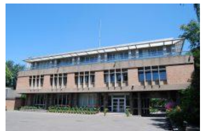
Embassy office building