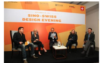
Panel discussion, Sino-Swiss Design Evening