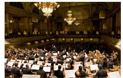
Tonhalle Orchestra Zurich